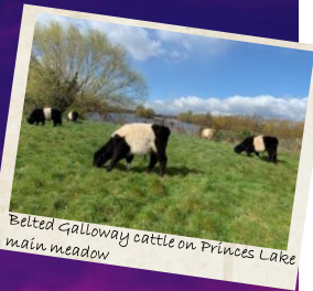
Belted Galloway cattle on Princes Lake main meadow

Eight Belted Galloway cows provided by Surrey Wildlife Trust were brought to Princes Lake.