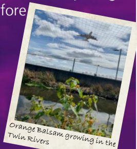
Orange Balsam growing in the Twin Rivers