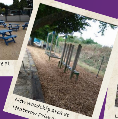
New woodchip area at Heathrow Primary