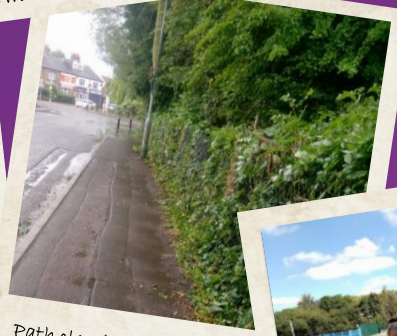
Path clearing in Colnbrook