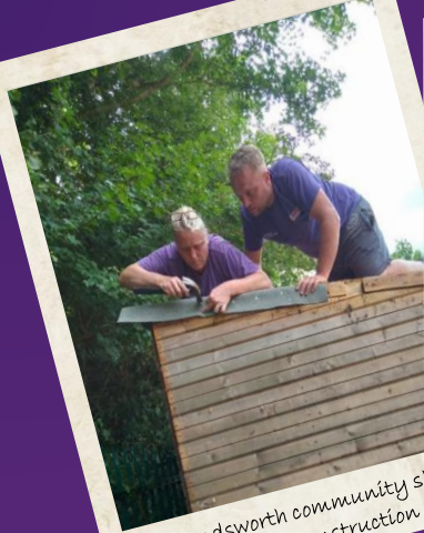
Hammondsworth community shed relocation and reconstruction