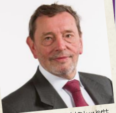
Rt Hon. Lord David Blunkett