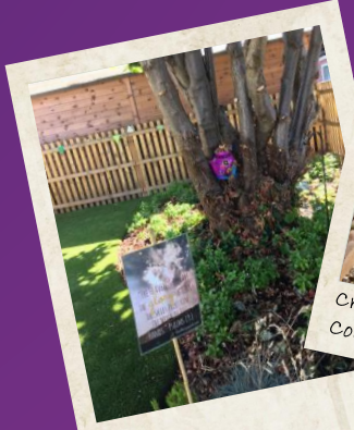
Creating a sensory garden at Colnbrook Primary