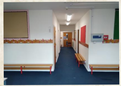
Repainting at Pippins Primary