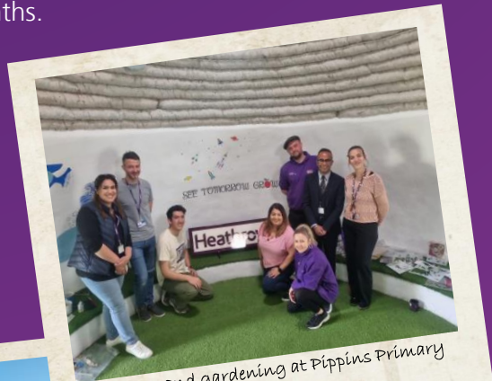
Decorating and gardening at Pippins Primary School with Heathrow volunteers

Here are just some of the projects they have undertaken in the last few months.