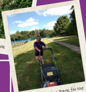
Preparing Pippins Park for the schools' Sports Day