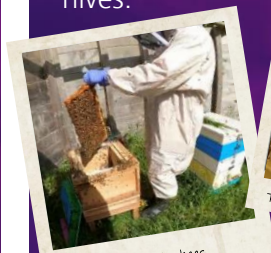
Transferring the bees

The team inherited some colonies in plastic hives from a previous beekeeper and in May the team, with the help of a local bee inspector, decided to move them into cedar wood hives.