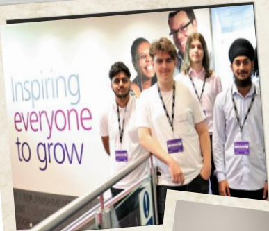
Our first cohort of T-Level students

Heathrow has been supporting T-Level placements for students from West London Institute of Technology and Cranford Community College. Our current cohort of students has recently completed a five-week project placement with Heathrow colleagues from our Digital and Technology teams. Heathrow has worked with the colleges involved to ensure that their placements prepare the students for work, further training or study. We wish them every success in their studies and future careers.