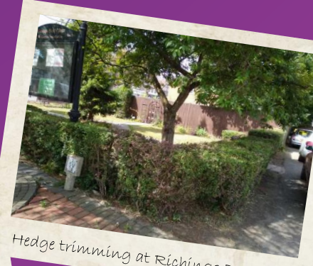
Hedge trimming at Richings Park

If you'd like support from the Heathrow Community Rangers, please contact: RangerRequests@heathrow.com