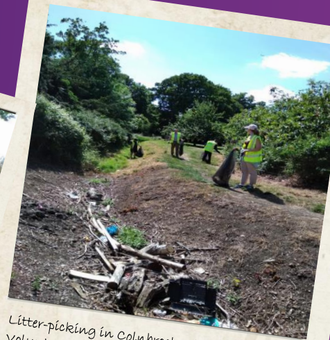
Litter-picking in Colnbrook with Heathrow volunteers