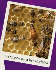
The queen and her workers