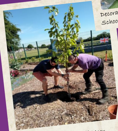
Tree planting at Stanwell Moor