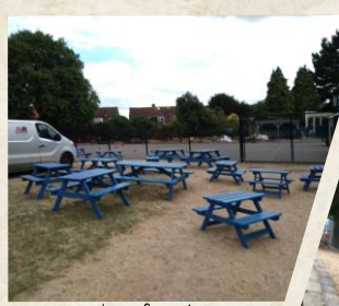
New outdoor furniture at Heathrow Primary