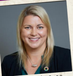
Baroness Liz Sugg