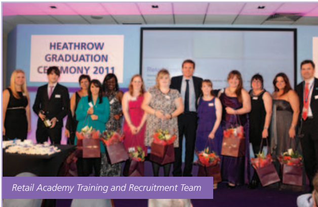
Retail Academy Training and Recruitment Team