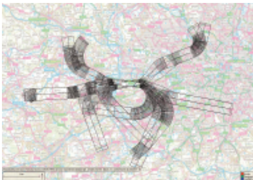
Heathrow Noise Preferential Routes map.

Air Traffic Control (ATC) are responsible for the routing of aircraft once airborne. When they have reached 4000ft, ATC can instruct the pilots to leave the NPR and fly a more direct heading to their destination. This is known as vectoring. Additionally, ATC can direct planes off the NPR at an altitude below 4,000ft if this is required for safe separation from other aircraft or for other safety issues such as weather avoidance. Therefore, if a plane is not following the NPR, it does not necessarily mean it is doing anything wrong. However, if you do have a query regarding a particular aircraft you may contact our Flight Evaluation Unit, who will be able to assist. Contact details are shown below and you can also make an enquiry via the 'Contact Us' section of our website.